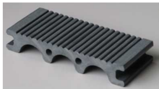
Arcade 2,1 kg/m

Price on request Used machinery as is without any warranty Subject to prior sales