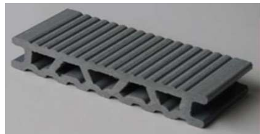
Vario 2,5 kg/m